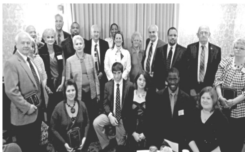
2011 SAFE Homes-Rape Crisis Coalition Volunteer Award Recipients

This award is presented to individuals and organizations in recognition of their outstanding service to victims of domestic violence and sexual assault in this community.